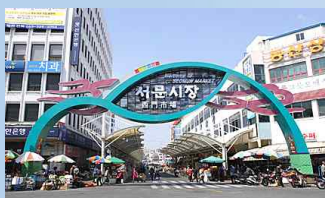
< Seomun Market >