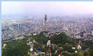
< Daegu 83 Tower >