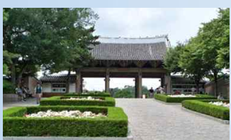
< Dalseong Park >