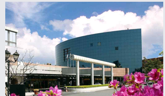
< Views at the Venue >