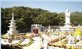
< Donghwasa >