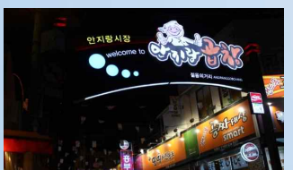
< Anjirang Gopchang Alley >