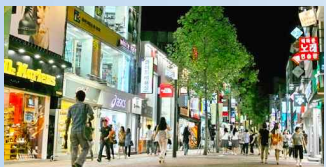
< Dongseongro >