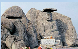
< Gatbawi >