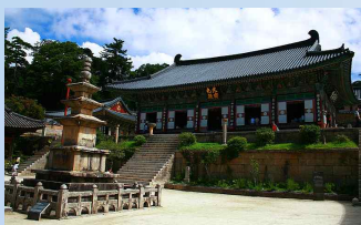
< Haeinsa, UNESCO >